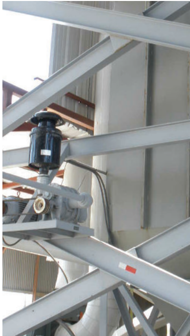
National Cement purchased two Sly pulse-jet collectors for venting the silos and loading spouts.