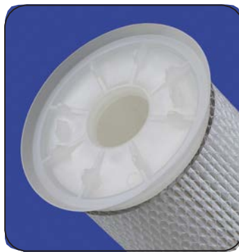
X100 Replacement end cap